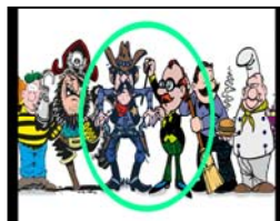
1.66 Side Matted Anamorphic