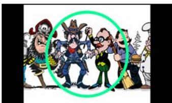
1.33 Side Matted or 1.33 Pillar Box