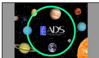
1.33 Side Matted or 1.33 Pillar Box