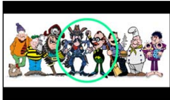
2.35 Letterbox * Original Film Aspect Ratio