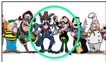
1.78 Full Frame