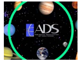
1.33 Full Frame Center Extraction