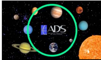
1.78 Full Frame