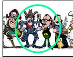
1.33 Full Frame Center Extraction