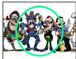
1.33 Full Frame Center Extraction