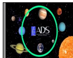
1.66 Side Matted Anamorphic