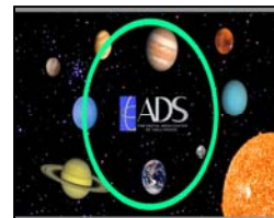
1.85 Matted Anamorphic