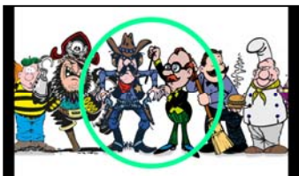
1.66 Side Matted