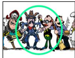
1.33 Full Frame Center Extraction