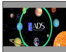
2.35 Letterbox Anamorphic