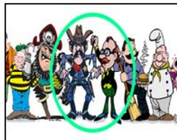
1.78 Full Frame Anamorphic