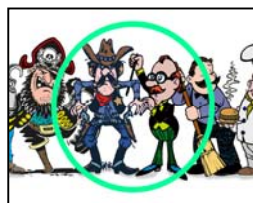
1.33 Full Frame