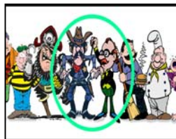
1.85 Matted Anamorphic