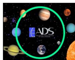
1.33 Full Frame