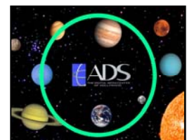
1.33 Full Frame Center Extraction