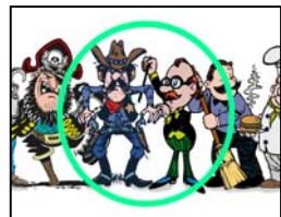
1.33 Full Frame Center Extraction