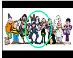
2.35 Letterbox Anamorphic