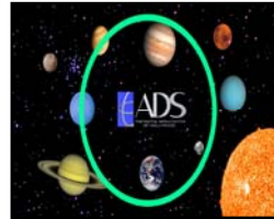
1.78 Full Frame Anamorphic